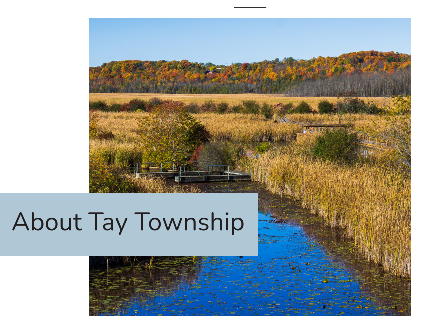
Tay Township is a strong, cohesive rural community.

We celebrate and promote our unique history, natural heritage, and recreational amenities as the cornerstone to our quality of life. Our unique villages and towns support a host of events, services and businesses that contribute to growing the local economy and create a unique destination experience for residents and visitors to the community.