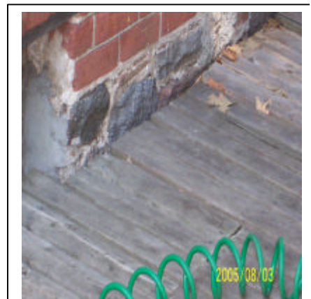
Fig 3: Fieldstone foundation