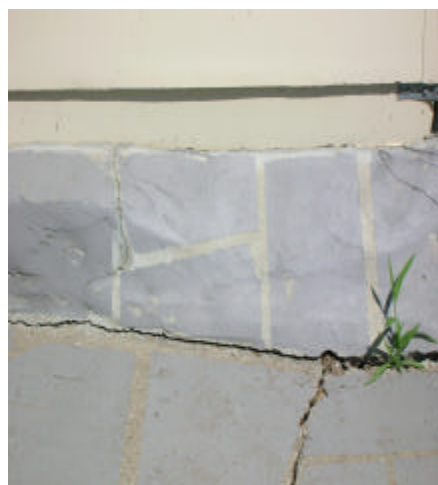
Fig 2: Poured concrete foundation