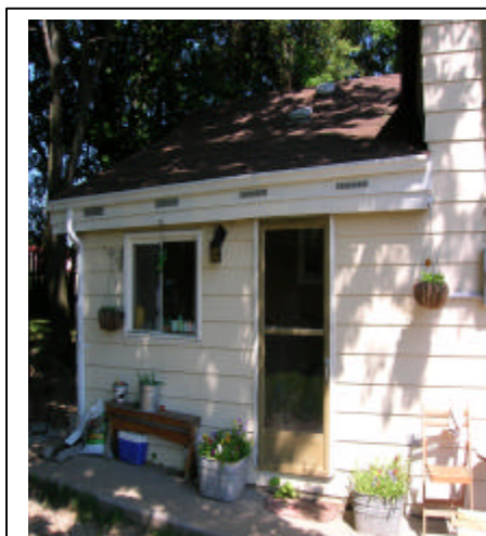
Fig 1: Addition

Construction of the home was completed in 1885, however an addition to the back of the house has been added as well as the front porch has been added shortly after the house was built (Figs 1 & 3). The house sits on a poured concrete foundation which has been painted to appear like a block foundation (Fig 2). The house contains its original windows. The home has been re-sided with a vinyl siding over insulbrick which covers an original wood frame house. The chimney exterior has been re-bricked with cement blocks. The house originally stood as an I-style home. This style is common for homes that were built as settler homes. They were non-stylistic, 2 stories tall but only one room wide. Therefore, the house appears tall and skinny. However, with the addition on the back of this home, the I-style appearance is not seen.