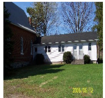
Fig 3: Addition to side of the church