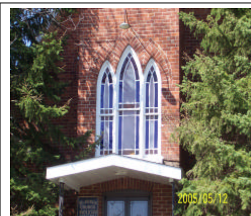
Fig 1: Front windows - original

The church has a steel roof on the main body of the church and the back end of the church has a shingled roof (Fig 2). The church still has its original fieldstone foundation. The building consists of its original windows (Fig 1); however, some in the back have been boarded up because of damage and age. There has been an addition added to the side of the church (Fig 3) which holds the kitchen, bathrooms, vestry and offices. In the interior, there have been many changes throughout the years such as new sanctuary chairs were donated in 1993. Carpeting and flooring have been replaced in the vestry and kitchen.