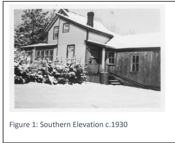
Figure 1: Southern Elevation c.1930

Built: 1880 Built By: Georgian Bay Lumber Company Structure: Frame House Exterior Wall: Aluminum Siding Style: Salt Box