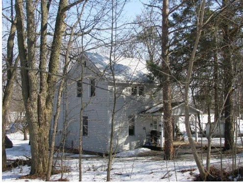
Figure 2: North Elevation