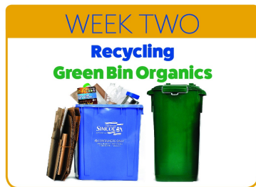
Week 2 Recycling & Organics Collection

For more information about waste collection visit Simcoe.ca/CollectionsChange or contact Service Simcoe at 1-800-263-3199.