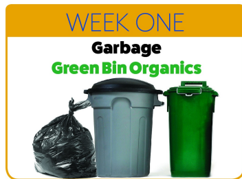
Week 1 Garbage & Organics Collection

Go to Simcoe.ca/WasteReminder or look for the free Simcoe County Collects app in the Apple App Store or Google Play.