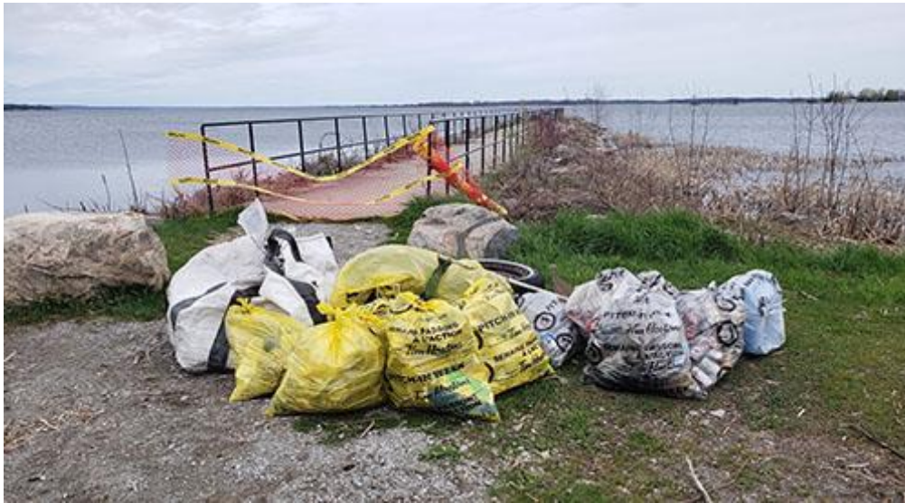
Talpines POA Tay Shore Trail Clean-up May 2020

Early this summer the Talpines Property Owners' Association spent a day cleaning up the Pine Street beach and along the Tay Shore Trail in the Waubaushene. Thanks for pitching in!