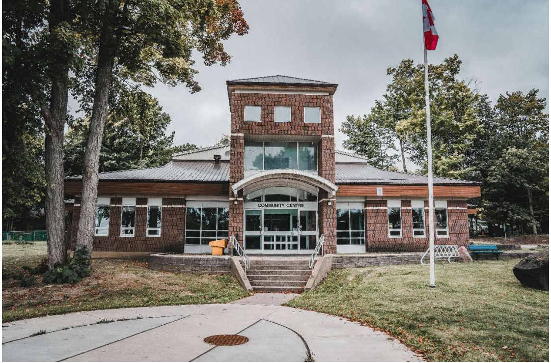
Oakwood Community Centre Rental Brochure