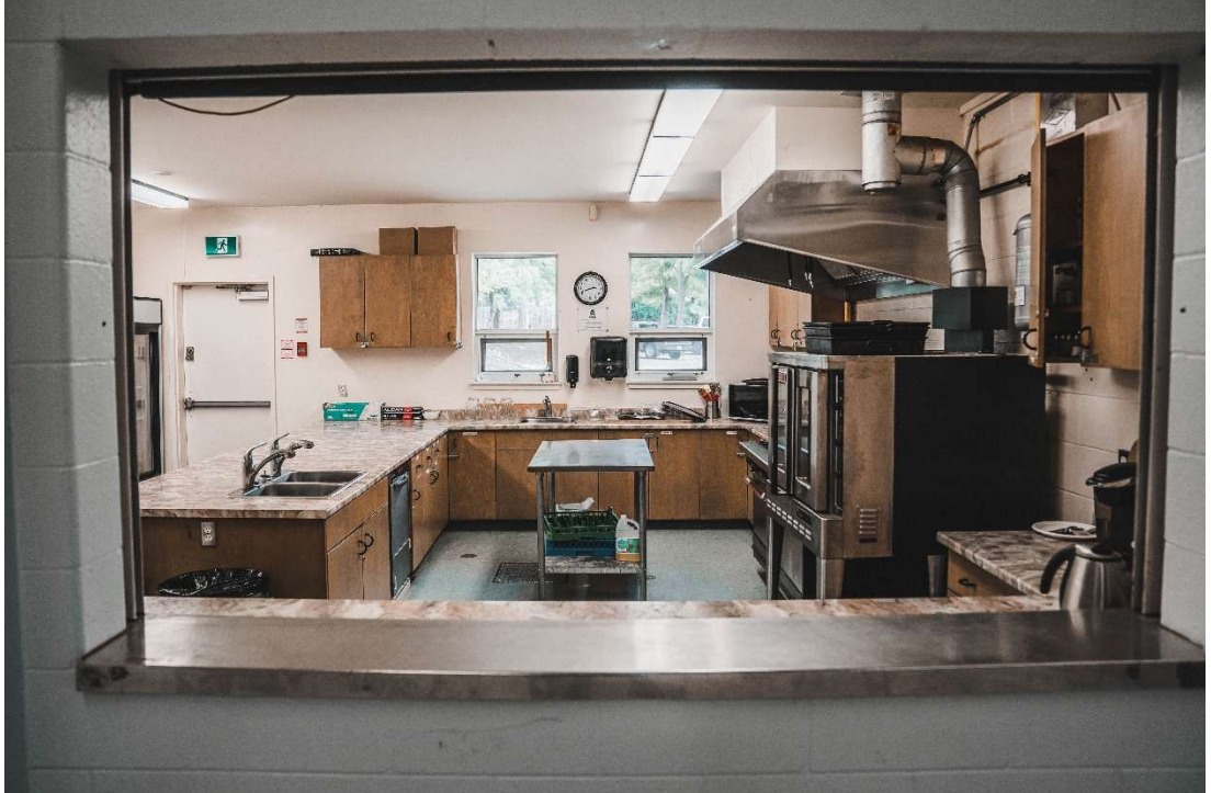
Oakwood Community Centre Rental Brochure