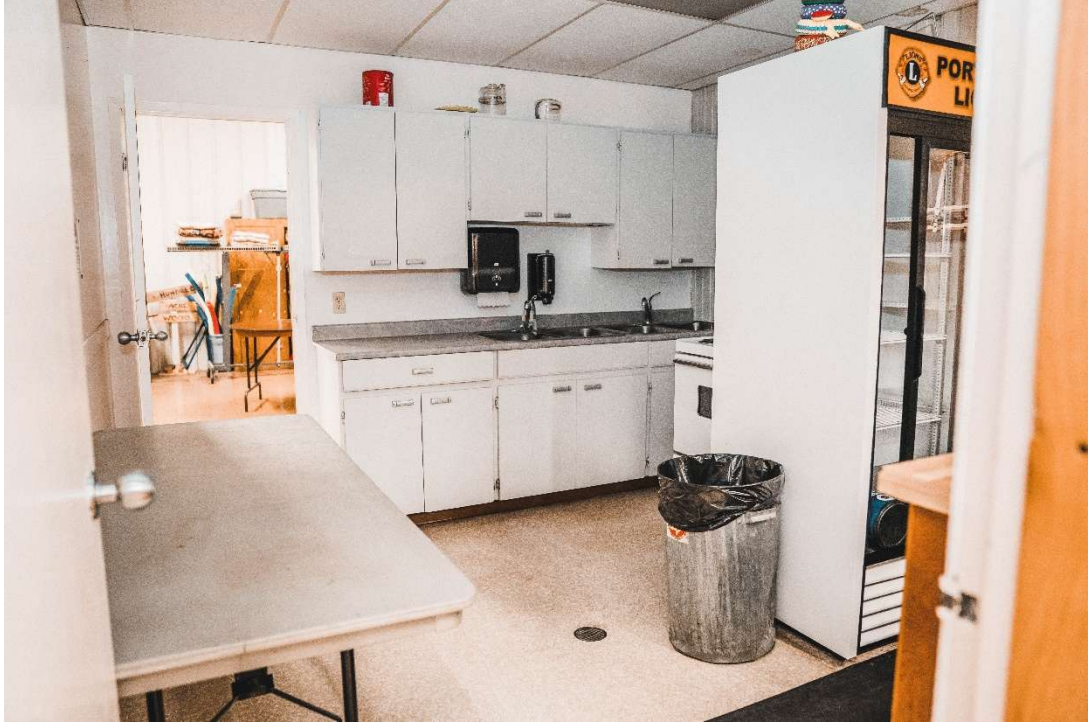
Port McNicoll Community Centre Rental Brochure